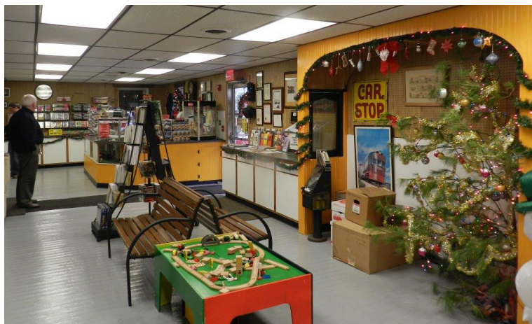
The Museum Store shows its holiday spirit and is a good place to warm up on a cold day