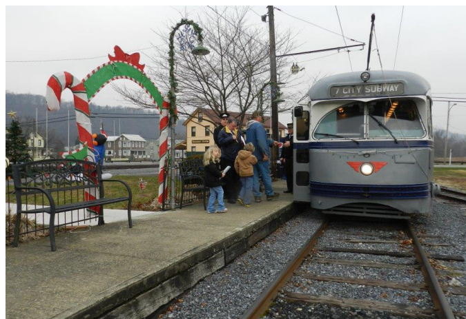
The Museum operating crew greets excited children as they board PCC 6 for the ride to Blacklog Narrows to see Santa Claus