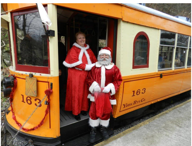
Santa and Mrs. Claus know the best way to get around to see all of the children in Rockhill Furnace is on a trolley!

For 2012, the holiday events consisted of six evenings of Polar Bear Express trolley operations and one day of Santa's Trolley operations. We were very happy to carry 1724 riders over this period. This is much better than our ridership in 2011 where we carried 1059 riders.