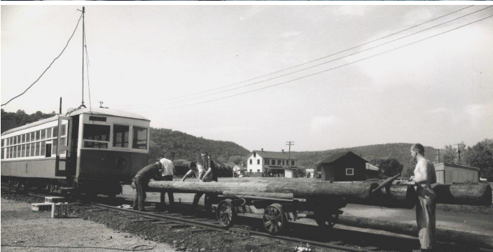
We have come a long way! Take a look at Johnstown Traction Company 311 in the early 1960s