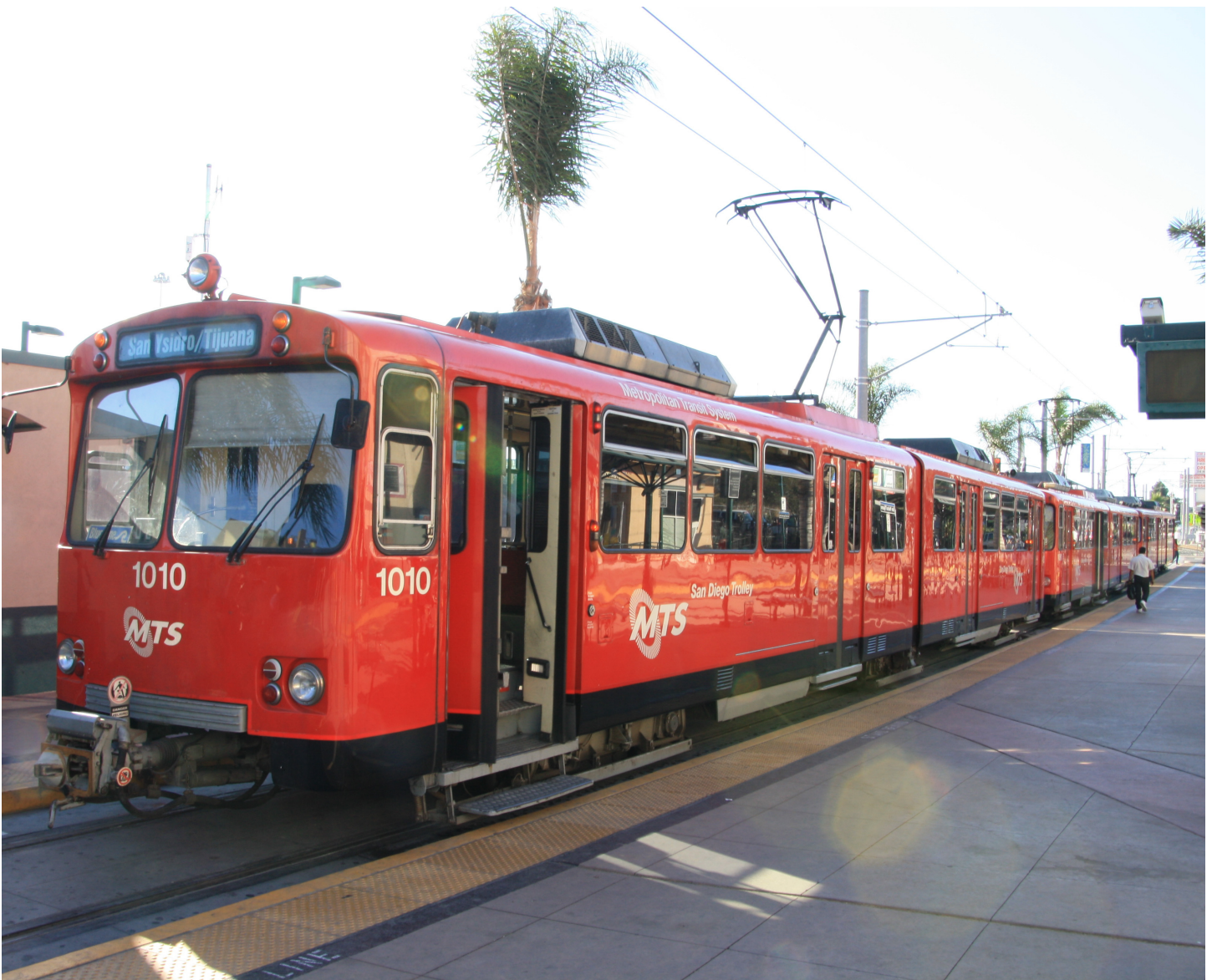
A Light Rail Vehicle from the San Diego Trolley will be coming to the Rockhill Trolley Museum thanks to the generous support of UTC/RAS, Inc. and our faithful donors. This relatively modern-era railway vehicle will be more than 30 years newer than Philadelphia Transportation Co. PCC #2743, currently the newest vehicle in the collection.

Help us bring our collection into a new generation. Contributions are solicited and greatly appreciated.