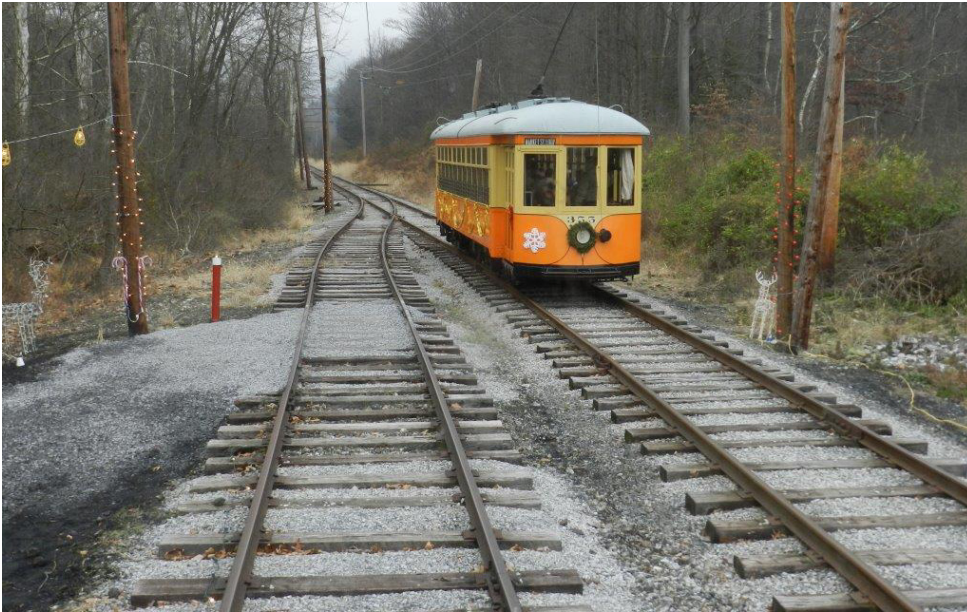
Johnstown Traction Company 355 heads out to Blacklog Narrows for a visit with Santa Claus