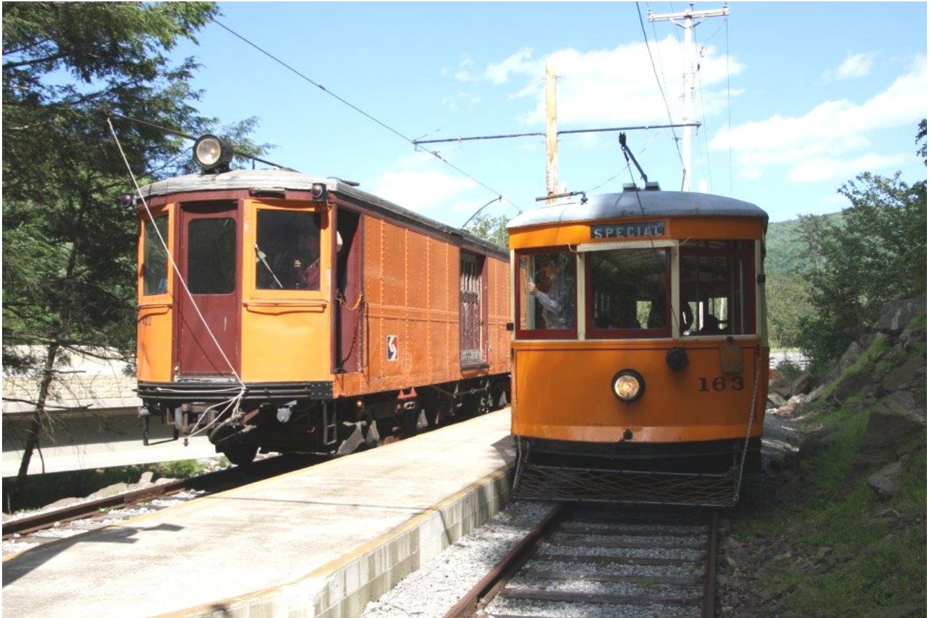
York 163 and P&W 402 at Blacklog during Members' Day 2013