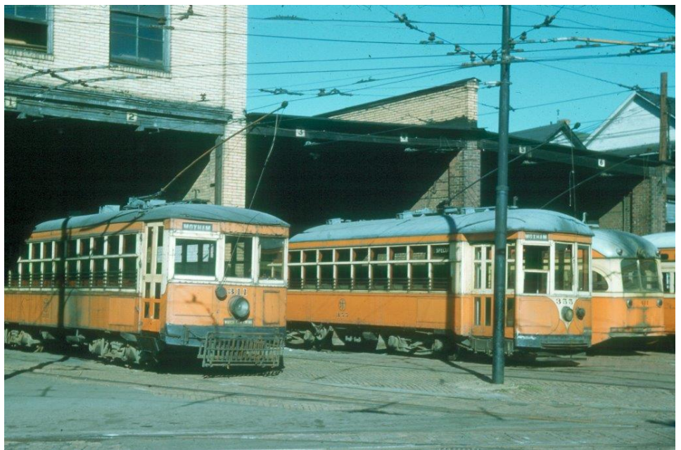
Johnstown Traction Company 311 and 355 are both at the Moxham carhouse on October 3, 1959. Soon, both cars will be operating together again at the Museum.

Due to the hectic schedules that we all have, the demands placed on us every day, and the distance to reach Rockhill, the time participating as a volunteer in any type of volunteer museum is one of the more demanding things you can ever do, but it is also one of the most rewarding. We look forward to seeing you as you find your rewards in volunteering!