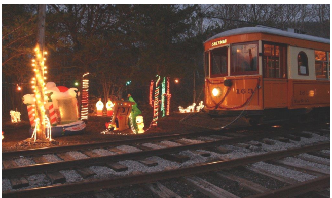
Altoff Siding is ablaze with lights as York Railways 163 stands by waiting for a return trip back to Meadow Street

The holiday events at the museum have become the largest special event the museum produces. It takes weeks of preparations plus the weeks the event is operating. Of course, all of this requires the dedication of our volunteers to adequately staff. Thank you to everyone that has helped make this possible.